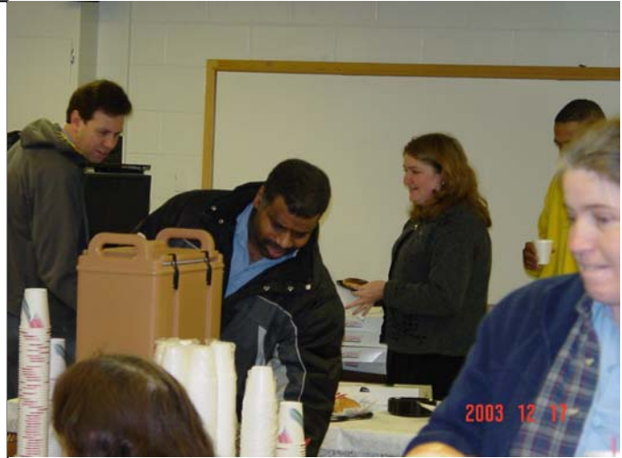
Ackron is a fillin' up!! From Christmas Employee Appreciation Day