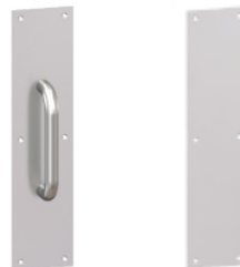
Pulls with 2 ½" Clearance – Size as Required