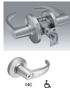
Cylindrical Lockset 14C Lever Design