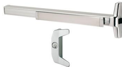
33A Series Push Pad Exit Device Night Latch/Dummy Trim