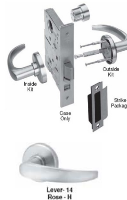
Mortise Lockset 14H Lever Design