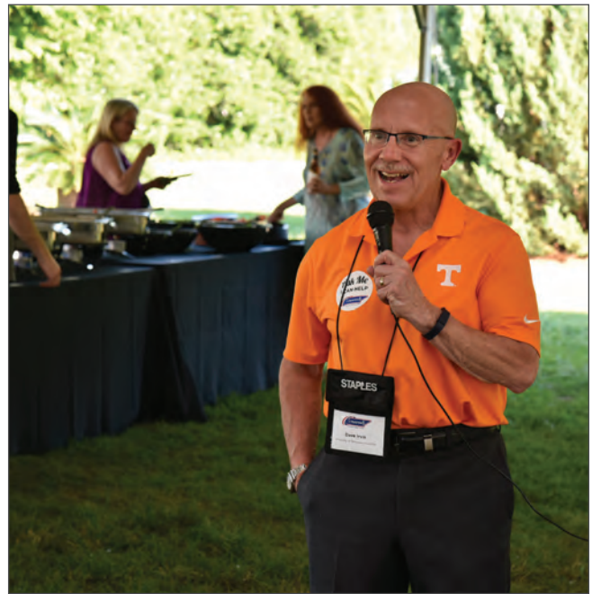
The 2018 TNAPPA Conference will be held on the campus of UT Chattanooga.

The conference officially wrapped up Wednesday with a brief morning meeting, Best Practices in Tennessee Educational Facilities Management, held at the Facilities Services Complex.