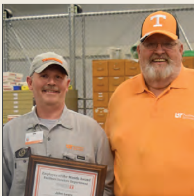
August: John Lewis