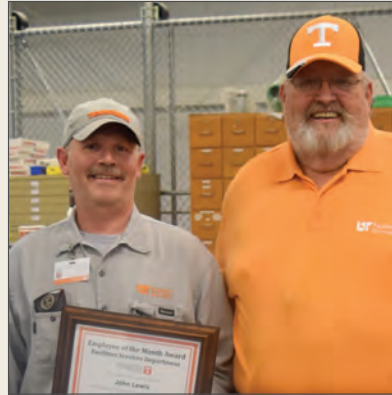
August: John Lewis