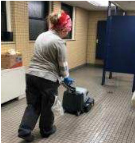
Floor work at Morgan Hall:

ADMINISTRATION • FACILITIES OPERATIONS • ZONE MAINTENANCE • ADMIN. & SUPPORT COMMUNICATION & INFO SERVICES • UTILITIES • DESIGN • CONSTRUCTION